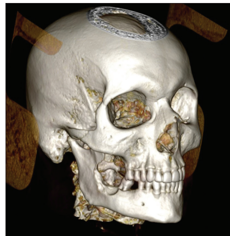
Figure 2: Preoperative three-dimensional cone beam computed tomography of mandible showing destructive lesion