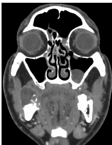
Figure 3: Preoperative coronal sections on contrast enhanced computed tomography revealed a heterogeneous, soft tissue expansile mass with hyperdense calcification in the right jaw