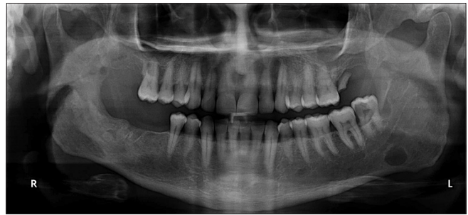
Figure 6: Postoperative panoramic radiograph evaluation after 1 year

The average age for the presentation of this lesion is 50 years, (range 17–72 years) with slight male predilection. Tumor occurs in the maxilla and the mandible with equal frequency, with canine to first molar region the most often affected site. [5] Patients are usually asymptomatic, although some complain of pain or discomfort.