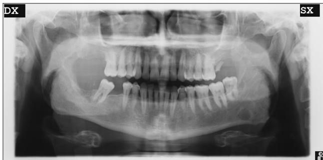
Figure 1: Preoperative panoramic radiograph showed distal osteorarefaction at the second right lower molar

It is characterized by islands of odontogenic epithelial cells immersed in a mature connective tissue. Typical is