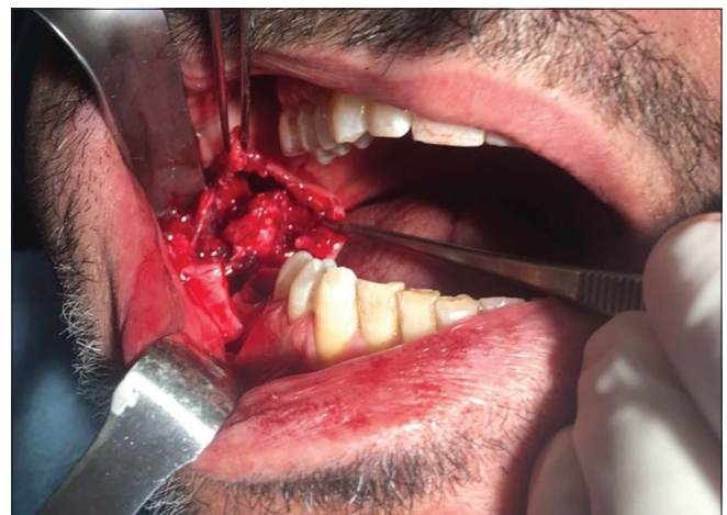
Figure 4: Surgical enucleation of the lesion