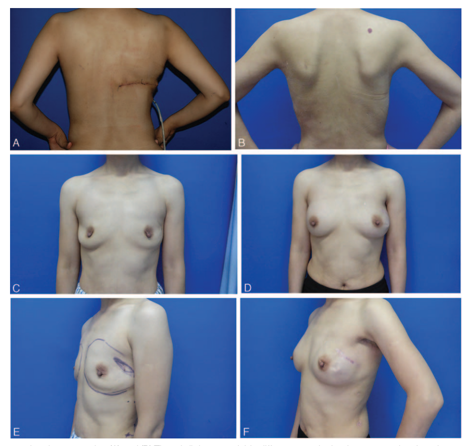
Figure 3. Patient 1. Postoperative view 5 months. (A) and (B) There is little appreciable difference on the back, compared to the other patient with a long donor-site scar who underwent the traditional latissimus dorsi flap harvesting technique for breast reconstruction. (C) and (D) The appearance of the breasts after reconstruction and cosmetic augmentation is better than that before the correction. (E) and (F) Scars of the 3 trocar ports along the anterior axillary line and posterior axillary line are barely noticeable.

Neither of the patients developed any complications related to the muscle flap such as flap loss, fat necrosis, seroma formation, or thermal injuries of the skin. Neither patient had scarring of the back or scarring in the axillary aspect, unlike other patients who develop significant scars on the back and axilla after LDMF transfer with the traditional method. The 3 ports created for the trocars along the anterior axillary and posterior axillary lines were barely noticeable, and both the patients and the medical staff found that the appearance of the breast in terms of shape, size, and symmetry was satisfactory (Figs. 3 and 4).