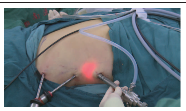
Figure 2. Laparoscopic instruments are in place. After trocar placement, a zero-degree endoscope is introduced in the right trocar; an electrocautery apparatus in the middle trocar; and grasper in the left trocar. CO_2 is insufflated at a pressure of 10 mm Hg as dissection proceeds.

After NSM, the breast incision is closed temporarily, and the patient's position is changed from supine to prone. The trocars are then placed at the marked points: a zero-degree endoscope is introduced in the upper trocar; the electrocautery apparatus (Hangzhou Kangji Medical Instruments Co., Ltd.), in the middle trocar; and a grasper (Hangzhou Kangji Medical Instruments Co., Ltd.), in lower trocar opening (Fig. 2). CO<sub>2</sub> insufflation is applied at a pressure of 10 mm Hg to maintain the patency of the optical cavity.