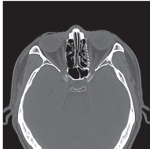
Fig. 5. Postoperative computed tomography scan. Axial views of postoperative computed tomography scans. Porous polyethylene incorporating titanium was used for the reconstruction of the medial wall fracture.