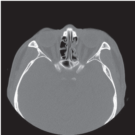
Fig. 4. Preoperative computed tomography scan. Axial views of preoperative computed tomography scans in the patients who were diagnosed with medial wall fracture.

In our series, there were no long-term complications such as the exposure of the placed implant, infections at surgical sites or foreign body reactions. In two patients who postoperatively had