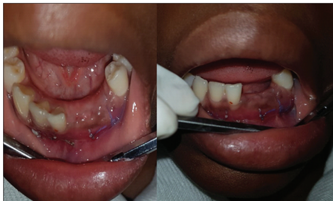
Figure 6: Postoperative photograph