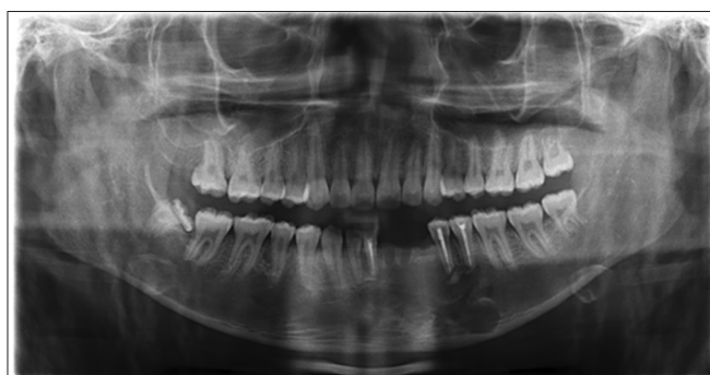
Figure 7: Postoperative orthopantomogram

UCA is a slow-growing, persistent, and locally invasive lesions, which may lead to bone deformation. [7] These expansile lesions exhibit well-defined radiolucent areas, which are surrounded by corticated borders, mainly in the posterior region of the mandible. [8] In this report, a multilocular mixed radiolucent lesion was seen in the mandibular anterior region causing root resorption, which deviates from the usual descriptions for this type of lesions in the literature. UCA may present three histological variants, where the luminal subtype of the tumor is confined to the luminal surface of the cyst and the cystic wall is totally or partially lined by ameloblastic epithelium; the intraluminal variant presents ameloblastoma nodules protruding into the lumen of the cyst, and finally, in the third variant, known as mural, wherein the cystic wall is infiltrated by ameloblastomatous epithelium in the connective