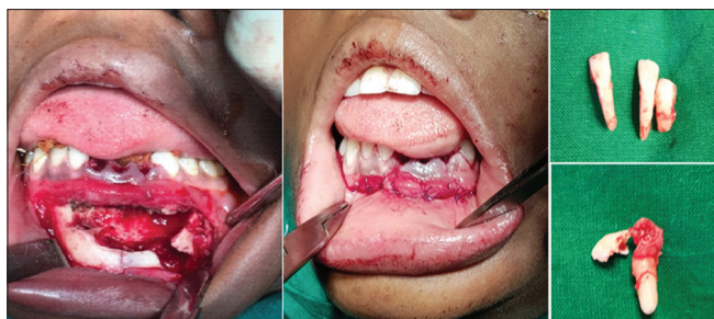
Figure 5: Intraoperative photograph: Buccal decortication with enucleation, extraction of 31, 32, 73, and impacted 33