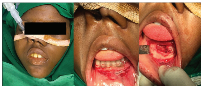
Figure 4: Intraoperative photograph: Nasotracheal intubation, incision, and periosteal flap elevation