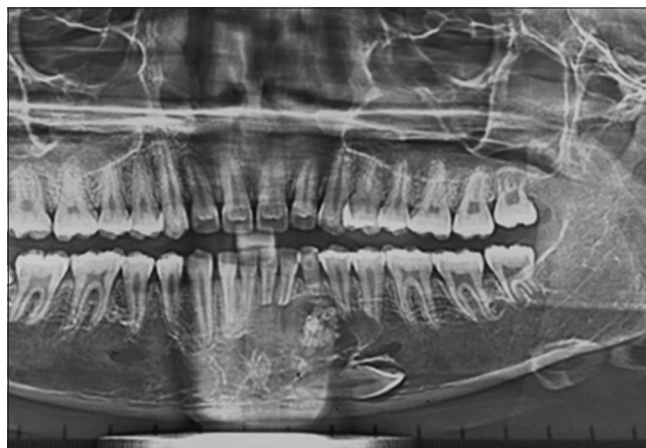
Figure 2: Cropped orthopantomograph radiograph