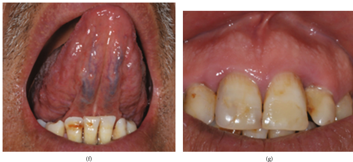
FIGURE 1: 59-year-old nonsmoker man. (a) Tongue. (b) Palate. (c) Right buccal mucosa. (d) Left buccal mucosa. (e) Orthopantomography showing moderate periodontitis associated to alveolar bone loss. (f) Inferior and (g) superior incisors showing minor enamel defects.

Furthermore, the patient will be planned for orthodontic treatment.