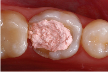
FIGURE 1: Initial examination of a 23-year-old female patient. A provisional restoration was identified within severely damaged molar (46).