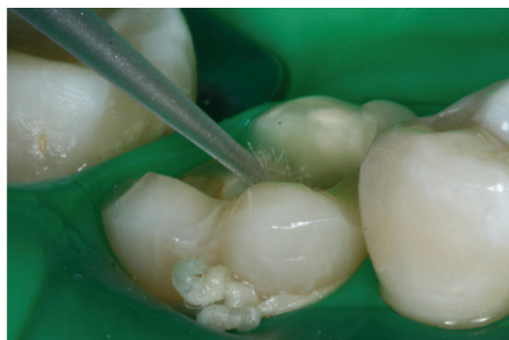
FIGURE 7: A conventional adhesive system (RelyX ARC) was used to bond the endocrown to the prepared tooth.

CEREC system (Sirona) [5]. The restoration was constructed using computer-aided design/manufacturing (CAD/CAM) and bonded to the preparation with reduced macroretention. However, other systems may also be employed, and recently Lander and Dietschi used the Empress II system to restore two molars with the endocrown technique [7]. In the present report, the VITA-PM9 system was employed. This dental ceramic system, newly introduced to the market, may show long-term efficacy similar to other VITA systems [8, 9]. According to the manufacturer, the VITA-PM9 is a pressed ceramic in a fine feldspathic composition, which produces excellent aesthetic results and polish. The system is also available in a variety of colors and translucencies and can be used in a wide range of cases including inlays, veneers,