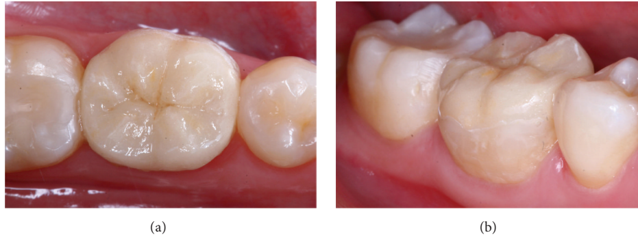
FIGURE 8: Final occlusal (a) and vestibular (b) view after bonding the endocrown using the VITA-PM9 system in a nonvital tooth.

The endocrown ceramic restoration using the VITA-PM9 system is a feasible and conservative approach for mechanical and aesthetic restoration of nonvital posterior teeth.