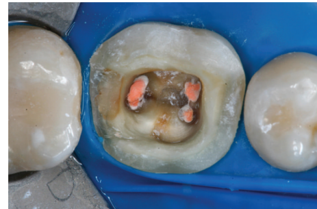
FIGURE 4: The tooth is first prepared by making the coronal pulp chamber continuous with the access cavity. The remaining tooth structure is still robust.

The internal surface was etched with hydrofluoric acid (Porcelain Etchant, FGM Produtos Odontológicos; Joinville, Santa Catarina, Brazil) for 60 s, rinsed with running water, and dried with an air syringe. The restoration was treated with Prosil, which is a silane coupling agent (FGM, Joinville, Santa Catarina, Brazil) according to the manufacturer's instructions. One coat of hydrophobic resin (Adper ScotchBond Multi-Purpose, 3M/ESPE, Seefeld, Germany) was applied and light-cured for 10 s.