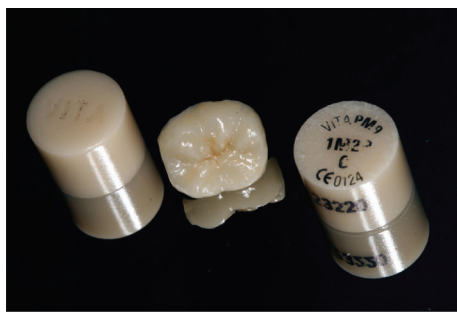
FIGURE 6: The monolithic ceramic endocrown after customization with the VITA AKZENT Plus system.