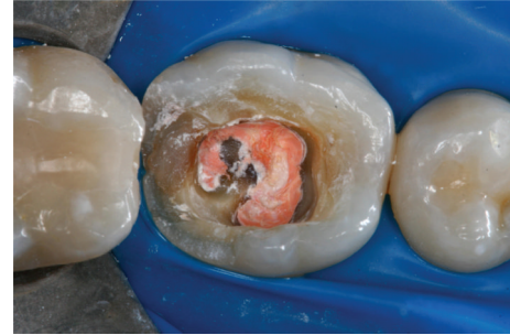
FIGURE 3: The molar after removal of the provisional restoration.

The endocrown was fabricated with an injected leucite-reinforced ceramic (VITA-PM9; Bad Säckingen, Germany) using the heat press technique (Figure 5). The VITA AKZENT Plus (Bad Säckingen, Germany) was custom-applied to enhance the shading and optical characteristics of the restoration (Figure 6).