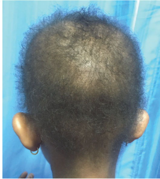
FIGURE 1: Short and sparse hair over the scalp.