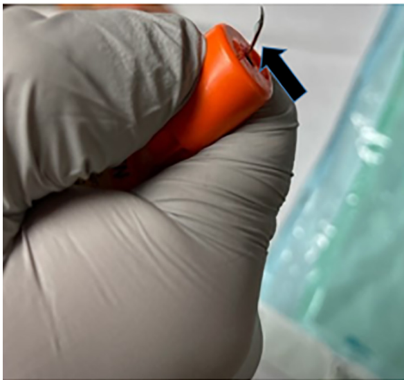
Image 3. Removed epinephrine auto-injector and bent needle (arrow).

objects in their mouths is a normal stage of early childhood development. 3 This case was particularly concerning due to the initial difficulty in removing the auto-injector and fear of accidentally discharging the adult-dose epinephrine into the patient. Efforts were made to stabilize the auto-injector with a bulky dressing and pillow. Due to the difficulty with initial removal, imaging was pursued. Maxillofacial CT is the optimal imaging study. 4