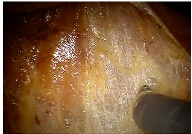
Fig. 1 Mesorectal dissection with enhanced view

The robotic surgeries included within this study were performed using either a da Vinci ® Si or a da Vinci ® X system. One of the drawbacks in the older, Si generation was difficulty in accessing two different operative fields (pelvis for rectum and left upper quadrant for splenic flexure) without having to change port configurations intraoperatively. This no doubt contributed to longer operating times. However, the newer systems, da Vinci ® X and Xi ® , have a lot more setup flexibility, which has gone some way to mitigating the issue of redocking, thus operating time can be reduced with the use of these two systems (Figs. 1, 2).