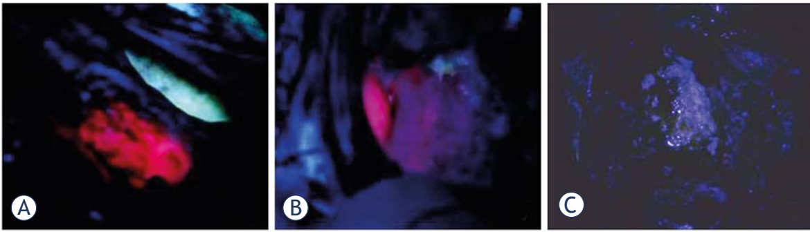
FIGURE 2. Appearance of the tumor cavity under the surgical microscope. (A-B) Violet-blue light excitation yielding visible 5-ALA fluorescence. Note robust (lava-like orange) (A) and mild (pink) brightness (B). (C) No 5-ALA fluorescence is visualized in the tumor cavity.

(pink) and robust brightness (lava-like orange) 18 (Figure 2).