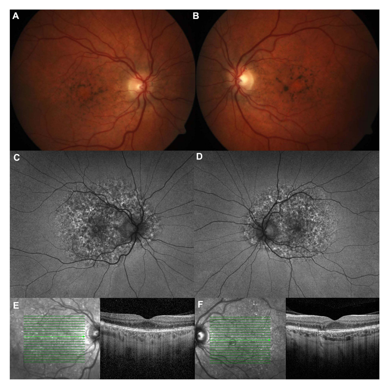
Figure 2 PPS-associated retinopathy. Notes: The patient is a 49 year old female with no family history of macular degeneration whose RPE mottling extends beyond the macula. She was on PPS for 8 years with a total cumulative dose of 1130g. She was heterozygous for variants of uncertain significance in CACNA2D4, PRPF8, and WHRN on genetic testing. On fundus photos of the left (A) and right eyes (B), she has hyperpigmentation and subretinal yellow deposits. On wide-field fundus autofluorescence (C and D), the hyper and hypoautofluorescent spots extend outside the macula. On optical coherence tomography (E and F), there is focal RPE thickening with hyperreflectance on near infrared images and atrophy.

carriers of at least one mutation associated with autosomal recessive inherited retinal diseases,<sup>23</sup> and a prior study found mutations in ABCA4 in 1 patient and 5 patients with VUS (29%).<sup>22</sup> It is possible that the patients who met the grading criteria for PPS-associated retinopathy may be carriers of inherited retinal dystrophies with variable expressivities or phenotypes, their pigmentary retinopathy