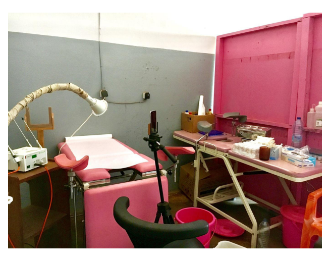
Figure 2 Device including the gynecological table, smartphone and tripod.

Once the patient record was created, the cervical images were acquired in a precise sequence: native, VIA, VILI and posttreatment whenever this was performed. The flash