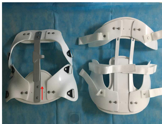
Figure 1 The spinal brace used in this study (thoracolumbosacral orthosis), which can be adjusted according to the height and weight of the patient (red arrow indicates the front side and the head side).

Demographic and operative data were recorded and compared between the two groups. The visual analog score (VAS) and vertebral body compression ratio (VCR) were recorded and compared at preoperation, on second day, at 2 weeks, 1 month, and 6 months after operation. Adjusted Oswestry Disability Index (ODI; excluding the section of sex life) was also recorded and compared for the same time points. Postoperative residual pain was defined as pain relief (VAS) of <50% on the second day after operation. In order to evaluate the efficacy of bracing after PVP for patients with postoperative residual pain, an additional separate analysis was performed for patients with postoperative residual pain. Collapse rate of operated vertebral body was compared between the two groups at 6 months after operation. Any relevant postoperative complications were recorded. The VCR was defined as the ratio between the anterior and posterior vertebral body height of the injured level. 13 Considering the