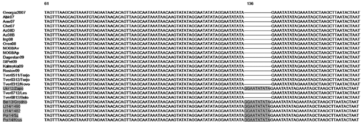
Figure 3. Partial nucleotide sequence alignment of the intergenic region between I73R and I329L in African swine fever virus (ASFV) isolates from eastern and central Europe, including a virus isolated in 2007 in Georgia (Georgia2007; GenBank accession no. FR682468.1). The mutation that results in the insertion of a single nucleotide internal repeat sequence (GGAATATATA) in the ASFVs from Belarus, Ukraine, Lithuania, and Poland is indicated by gray shading.