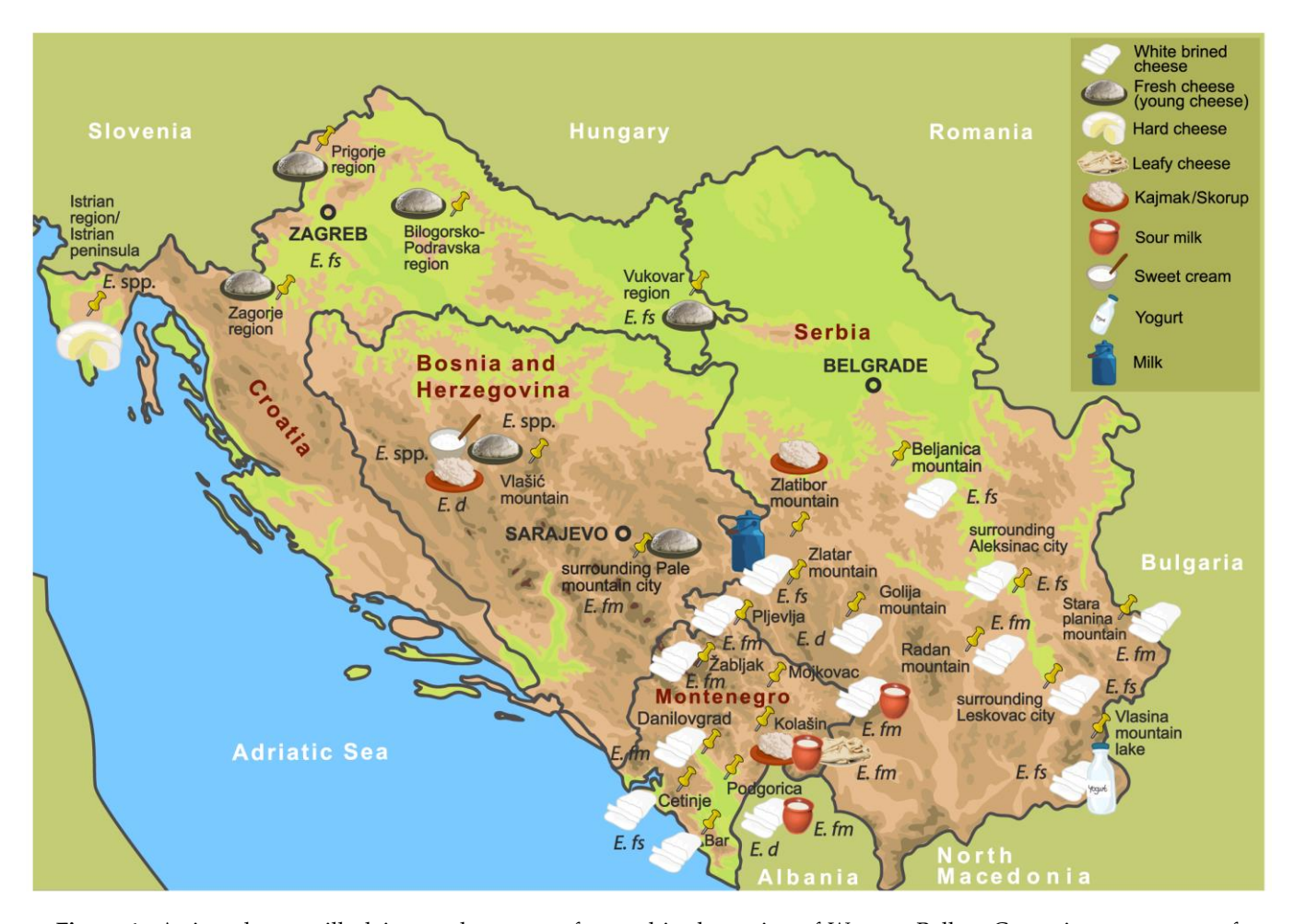
Figure 1. Artisanal raw milk dairy products manufactured in the region of Western Balkan Countries as a source of Enterococcus spp. Note: Most prevalent Enterococcus spp. in certain geographical localities: E. spp., Enterococcus species; E. fm, Enterococcus faecium ; E. fs, Enterococcus faecalis ; E. d, Enterococcus durans [11,54].

cheeses, sweet creams, and sweet kajmaks in Bosnia and Herzegovina; and leafy, white and semi-hard cheeses and skorups in Montenegro (Figure 1) [11,33,47,48,52,53,62,63]. Most of them were identified as E. durans (44%), E. faecalis (35.9%), and E. faecium (17.9%), while less than 2% were E. italicus strains [33]. Similar data were reported by authors who determined the enterococcal population in artisanal dairy products manufactured in other regions [64,65].