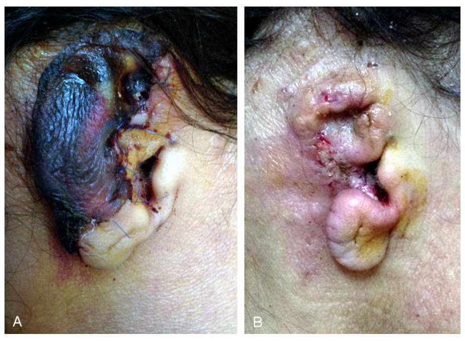
Figure 5: Ischemic right ear due to human bite. A) Ischemic right ear. B) Davis flap for upper third defect.

area is made of two layers of skin that are thin and may contract [16].