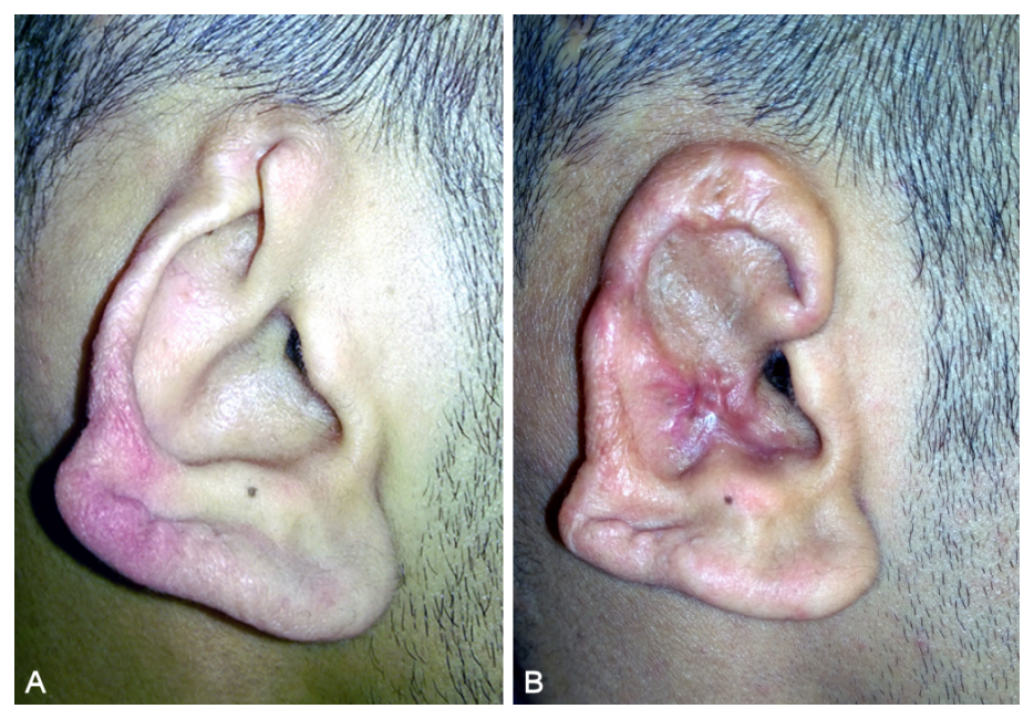
Figure 4: Loss of upper third of left ear by knife. A) Loss of upper third. B) Complete healing of the flap after 3 months.