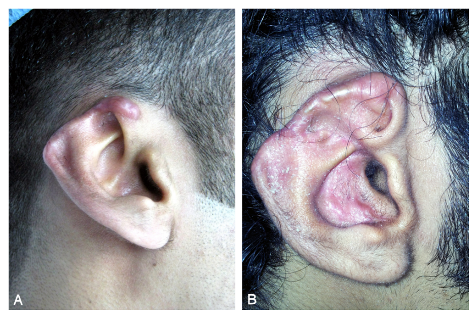
Figure 2: Loss of upper third of right ear after human bite injury. A) Loss of upper third after debridement. B) 6 month postoperative.