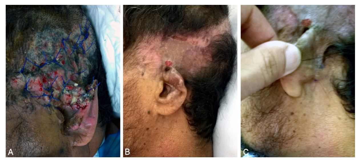
Figure 3: Loss of upper third of left ear after motor car accident. A) Loss of upper third. B) Complete healing of the flap (2 months postoperative). C) Complete healing of graft donor site with preservation of postauricular sulcus (2 months postoperative).

Also, Yoshimura and his colleagues described a combined postauricular skin flap and a mastoid fascial flap [11]. The two flaps were then used to sandwich a fabricated costal cartilage framework. The donor area for the mastoid fascial flap was skin grafted. The difference of this technique from that presented by Yotsuyanagi et al. was in using free rib cartilage graft instead of chondrocutaneous flap [10].