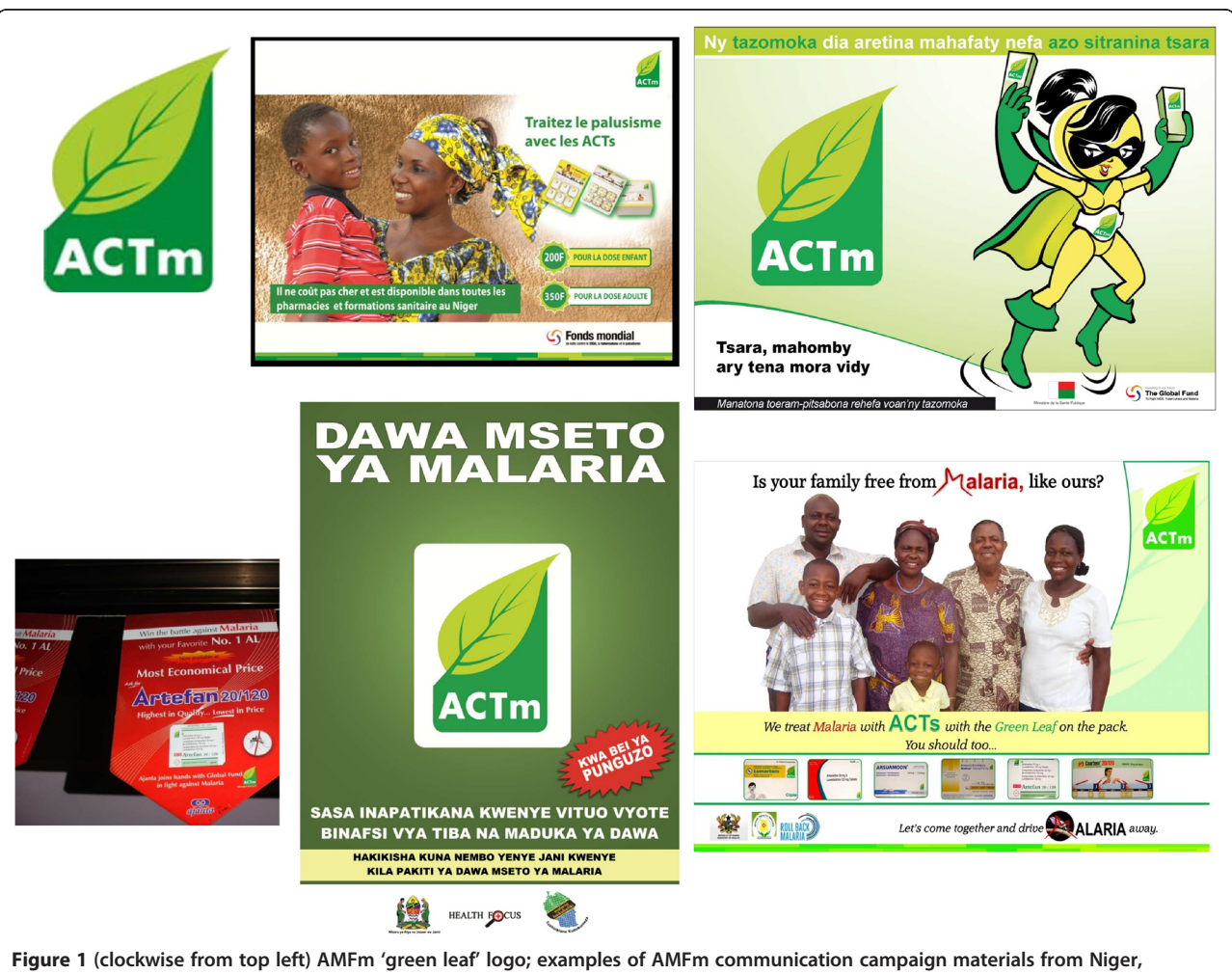
Figure 1 (clockwise from top left) AMFm 'green leaf' logo; examples of AMFm communication campaign materials from Niger, Madagascar, Ghana and Kenya; and an example of commercial promotion for co-paid ACT from Ghana.

Communication campaigns, including the use of mass media, have been used alone or as components of interventions to address a variety of public health problems in low and middle income countries including HIV prevention, family planning promotion, and the use of insecticide-treated bed nets for malaria control [5]. The effectiveness of such campaigns on behaviour change