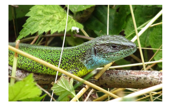
FIGURE 1 Adult male of the eastern green lizard Lacerta viridis in Passau, Germany.

higher influence of vegetation structure in the microhabitat selection in the northern periphery, where the availability of suitable habitats for the species is a limiting factor, while in the core, where the available range of habitats is broader, abiotic parameters will have a higher influence in the microhabitat selection.