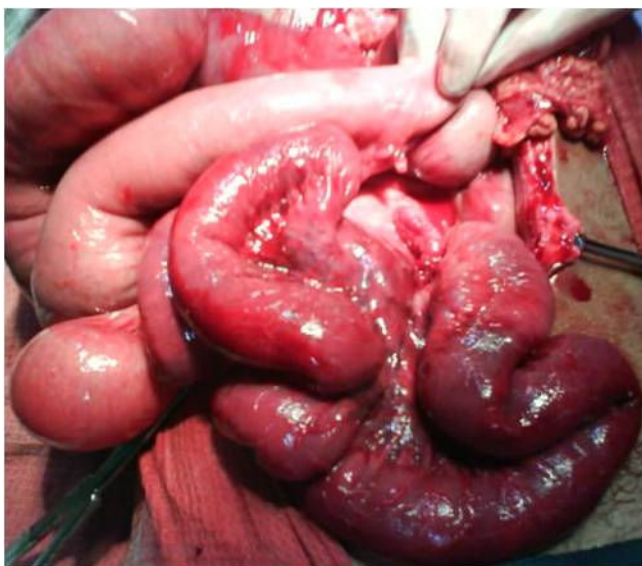
Figure 1 On table picture showing dilated proximal intestinal loops and a part of Ischemic ileum. Note the clear line of demarcation between healthy and involved ileum.

Abdomen was opened with a midline vertical incision. Three litres of hemorrhagic fluid was drained. Dilated jejunal loops were seen. These loops were traced up to a segment of ischemic ileum. The ileal segment was strangulated by a band composed of inflamed appendix and omentum (Fig 1 & 2). The band was running from caecum