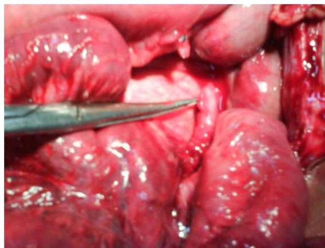
Figure 2 Higher magnification picture showing the band which had produced strangulation. This band composed predominantly of appendix and in part by omentum (not shown in this picture). Note the area of attachment of the band on distal ileum.

to ileum producing a window underneath. Through this window the intestine had protruded (Fig 3).