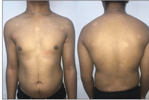
Figure 1: Multiple hypopigmented macules of varying size on the trunk and upper limbs with few lesions showing overlying erythema

For reprints contact: WKHLRPMedknow_reprints@wolterskluwer.com