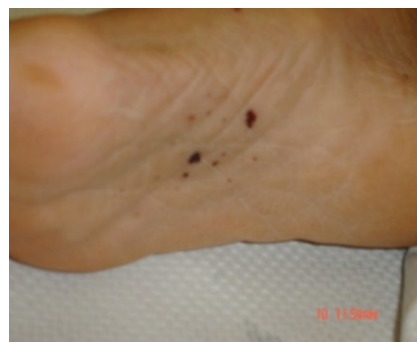
Figure 2. Petechial lesions in the plant of the right foot.