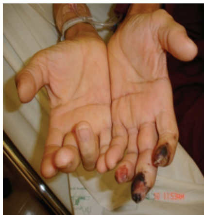
Figure 1. Necrohemorrhagic lesions in the distal phalanx of the 2 nd , 3 rd and 4 th fingers.