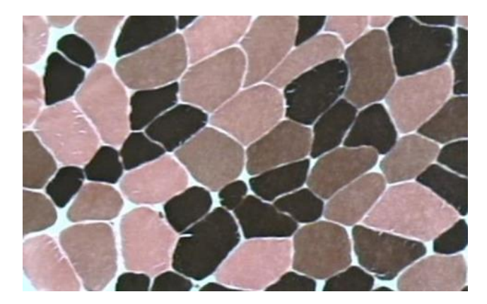
Figure 2. Myosin ATPase staining of a cross-section from vastus lateralis muscle of an elite hammer thrower (80.45 m best performance), preincubated at pH 4.6 and post-stained with eosin. Type I fibers appear as dark grey, type IIA fibers appear as moderate grey and type IIX fibers appear as light violet. Selective hypertrophy of type II fibers is obvious. Some small-sized type I fibers are shown [33].

Studies that have investigated the role of muscle fiber type composition and the possible link with track and field throwing performance are presented in Table 3. Analysis of the original data of the study of Coyle et al. [24] revealed that the percentage of type II muscle fibers in gastrocnemius was not correlated with shot-put throwing performance. Likewise, a study in novice throwers showed that the percentage of type II muscle fibers in vastus lateralis was also not correlated with shot-put performance [30]. Additionally, there was a low correlation between hammer throwing performance and the percentage of type II muscle fibers (r = 0.41) [33]. Therefore, although throwers have more type II fibers in their protagonist muscles, the percentage of these fibers may not be correlated with performance.