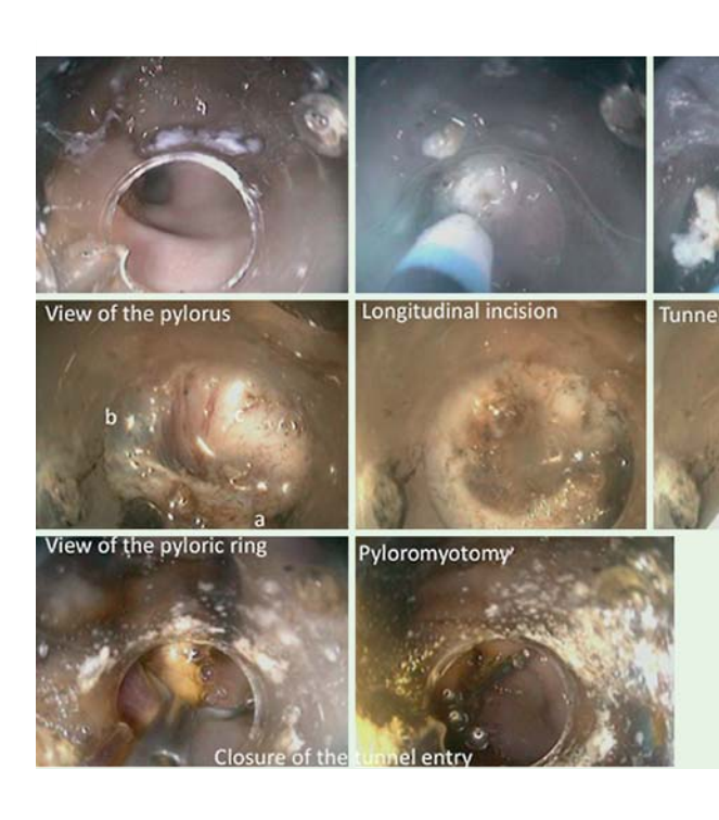
Fig. 1 Peroral pyloromyotomy. a, pyloric ring; b, submucosa of the bulb; c, mucosa of the bulb.