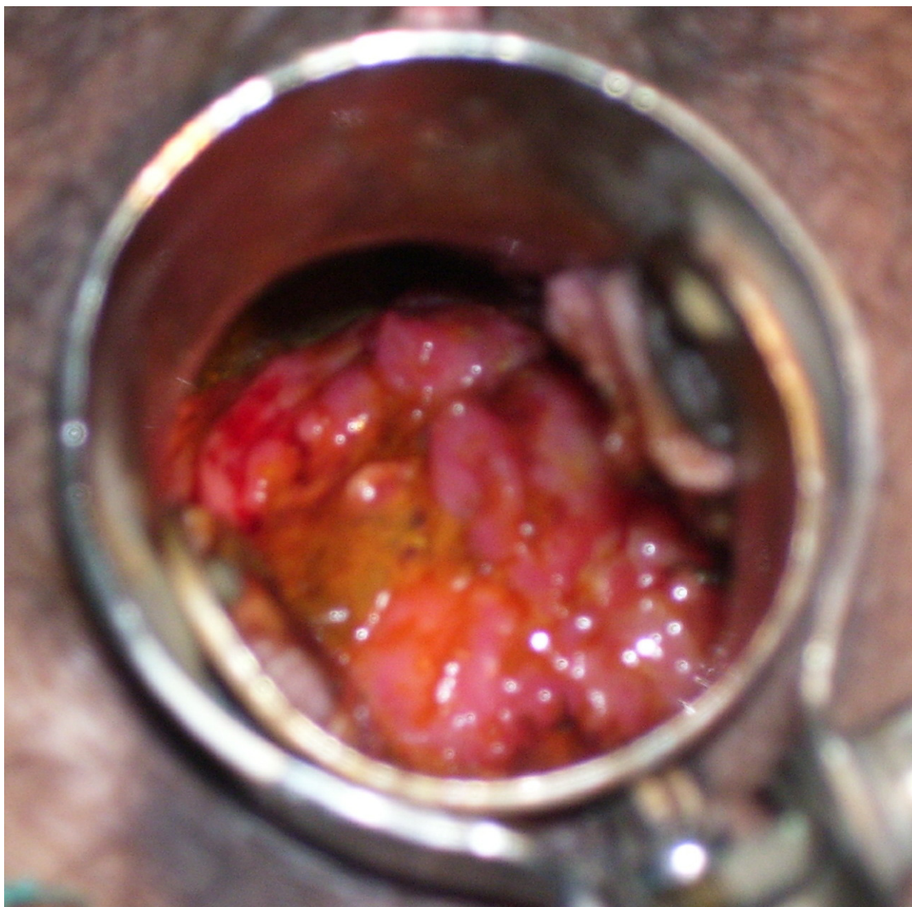
Figure 1 Per speculum view of the cervix at the time of presentation.

almost normal appearance and there was complete relief from symptoms.