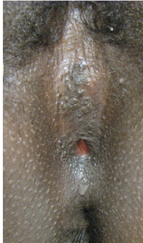
FIG. 2. Twenty-one year old nulliparous woman with a female genital mutilation type IIIb.

III) is performed in 15% of cases (Fig. 2), although with great variability among countries. 1