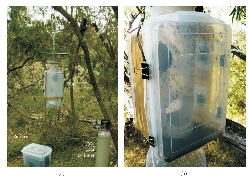
FIGURE 2: CO<sub>2</sub>-baited updraft box trap deployed near Bunbury, Western Australia. (a) The trap is powered by a battery and baited with CO<sub>2</sub> released from a compressed gas cylinder. (b) Close-up view of trap showing collected mosquitoes.

trap nights [29]. Although the results from the field trial were promising, the issues identified during the trial prevented mosquito-based surveillance on a large scale as a replacement for sentinel animals.