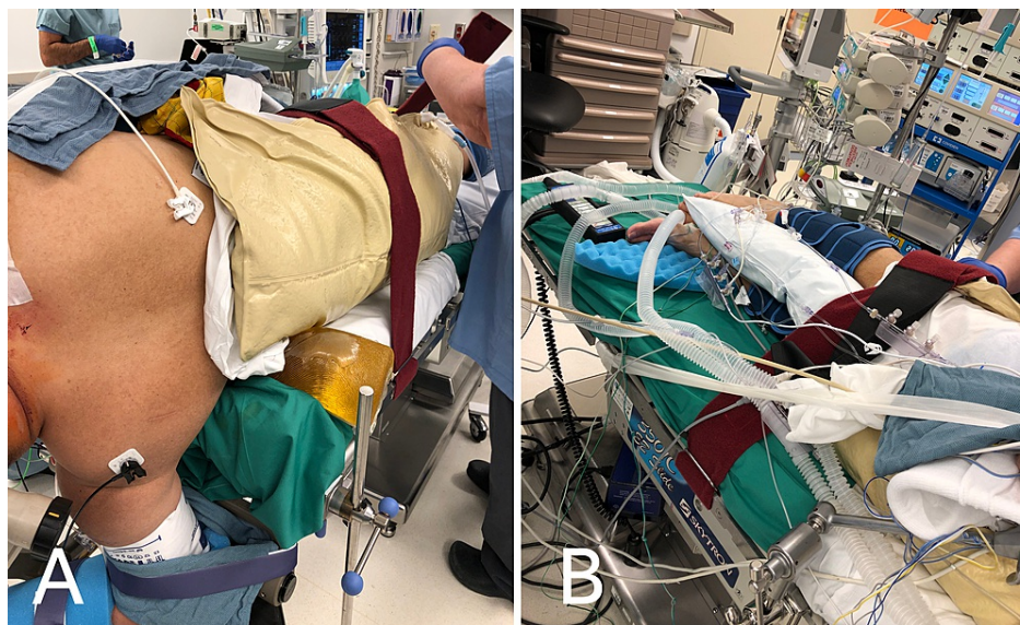
FIGURE 2: Perioperative images demonstrating proper strap placement

Proper positioning is shown with shoulders perpendicular to the floor, and head and neck without excessive flexion, extension, or side bending. Multi-position arm boards for the positioning of the lower arm allow for anatomical variations in external rotation of the glenohumeral laxity (A) and shortened humerus length (B).