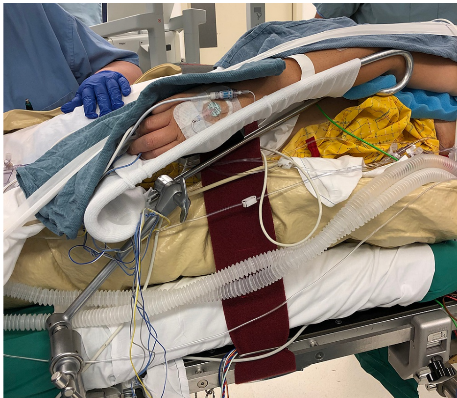
FIGURE 4: Perioperative image demonstrating proper arm support placement

Multi-position arm boards for the positioning of the lower arm allows for anatomical variations in degree of external rotation of the glenohumeral joint (A) and humerus length (B).