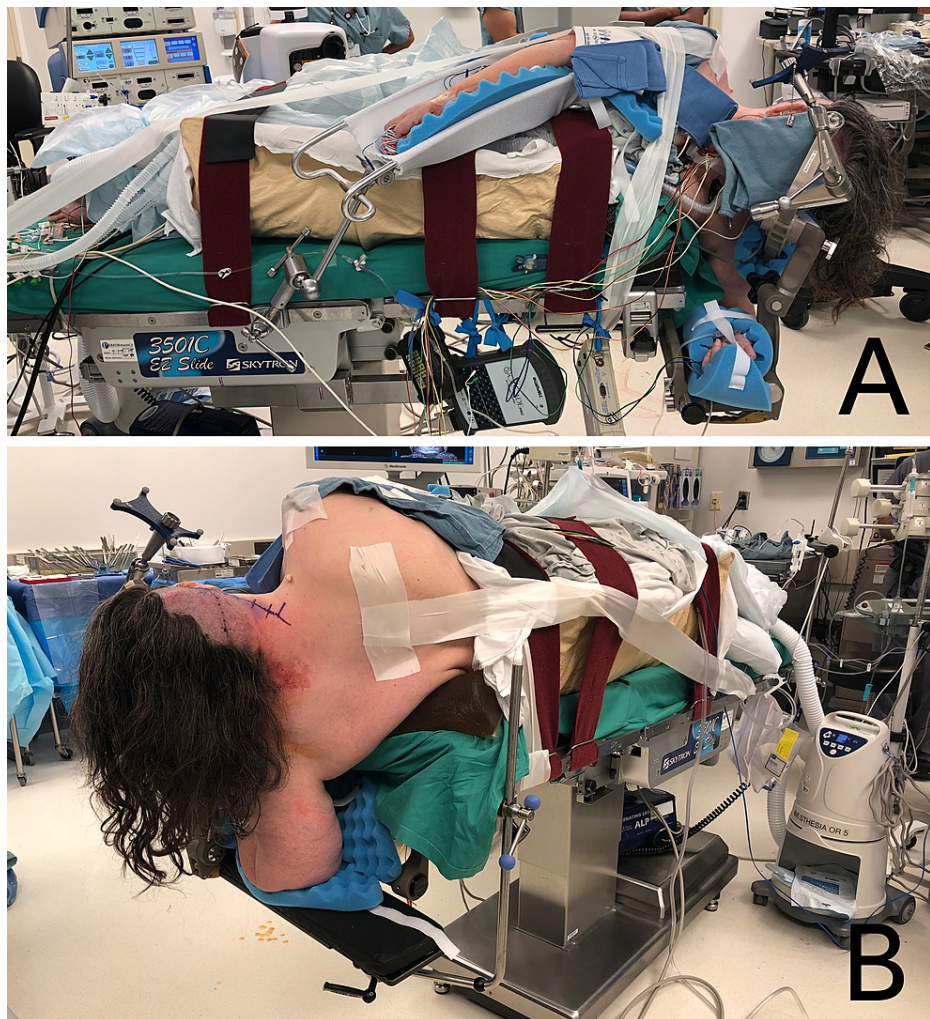
FIGURE 5: Perioperative images demonstrating proper Arrowhead park bench setup

Anterior (A) and posterior (B) aspects of the proper setup of the Arrowhead technique to the park bench position for an obese patient.