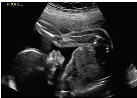
FIGURE 2: Anatomy assessment at 21-week gestation shows continued flat facial profile with nasal hypoplasia.

supplement containing vitamin K. During the admission, hypokalemia was corrected and she received daily injections of multivitamin, thiamine, and folate with her intravenous fluids.