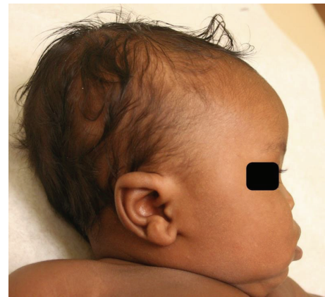
FIGURE 4: Facial profile 2 months after delivery shows nasal hypoplasia consistent with previous ultrasounds.