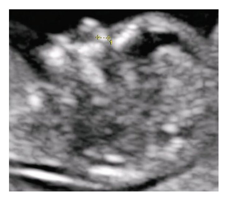
FIG. 1. Foetal nasal bone length measurement. Note that the calipers are in the out-to-out position.

The pregnancy outcomes were obtained from a computerized perinatal database. The adverse perinatal outcomes were as follows: preterm birth, which was defined as any spontaneous delivery before 37 completed gestational weeks (<259 days); preterm labour, which was defined as labour (regular uterine contractions resulting in changes in the cervix including effacement and dilatation) before 37 completed gestational weeks (<259 days); and preterm premature rupture of membranes (PPROM), which was defined as rupture of the membranes before the onset of labour occurring before 37 completed gestational weeks (<259 days). Early preterm birth was defined as any spontaneous delivery before 34 completed gestational weeks (<238 days). Gestational diabetes mellitus