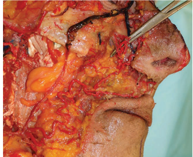
Fig. 4. Cadaveric dissection demonstrating anatomy of infraorbital artery and its communication with facial artery.

An estimate of 500 units for 1 vascular territory and 1,000 units for 2 areas has been suggested in high-dose pulsed hyaluronidase protocol and was followed in this case. 4 The golden period of starting the treatment after intra-arterial filler injection is as early as the diagnosis is made, and it should not be later than 72 hours, to avoid skin necrosis and scarring. In an experimental study about free flap skin survival, more than 9 hours of warm ischemia was found to severely affect the survival of the skin component. 9 Although most studies suggest injection of hyaluronidase, there is no unanimity on dosage and the interval between 2 doses. 10 It can be injected on an hourly basis till the endpoint of treatment showing reperfusion of skin and correction of blanching/livedo. As the hyaluronidase concentration in the affected tissue goes down with time due to its degradation, dilution with extra-cellular fluid and diffusion into surrounding tissue, its replenishment at regular intervals is needed for maintaining its high concentration in affected tissue. This new modality of high-dose pulsed hyaluronidase works on the principle that an adequate amount of hyaluronidase at high concentration levels is needed for sufficiently long duration for it to dissolve the HA material present in that vascular territory. 4