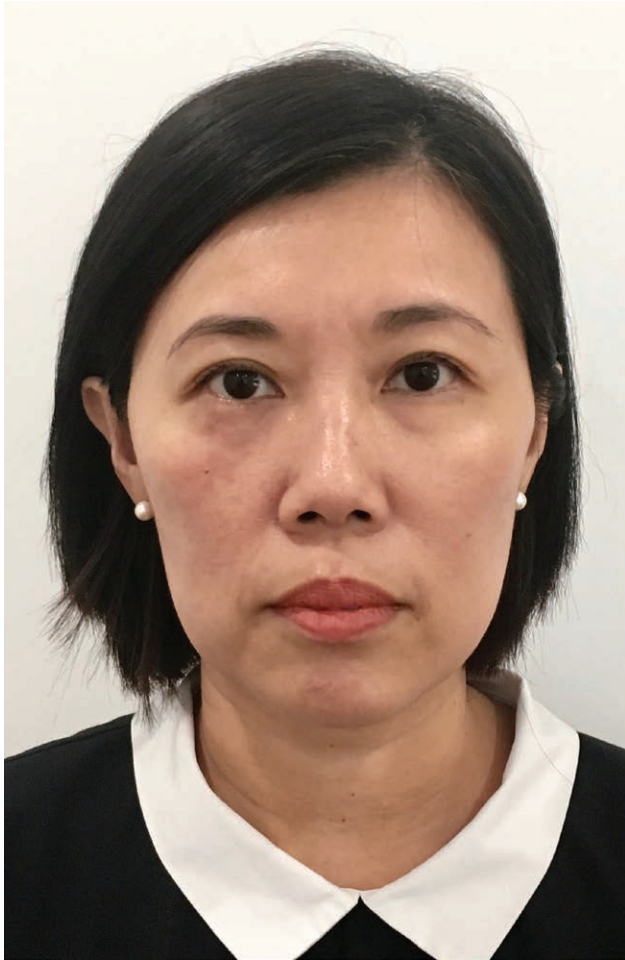
Fig. 3. At 20 days, post-hyaluronidase, showing complete recovery with no scarring.

An estimate of 500 units for 1 vascular territory and 1,000 units for 2 areas has been suggested in high-dose pulsed hyaluronidase protocol and was followed in this case. 4 The golden period of starting the treatment after intra-arterial filler injection is as early as the diagnosis is made, and it should not be later than 72 hours, to avoid skin necrosis and scarring. In an experimental study about free flap skin survival, more than 9 hours of warm ischemia was found to severely affect the survival of the skin component. 9 Although most studies suggest injection of hyaluronidase, there is no unanimity on dosage and the interval between 2 doses. 10 It can be injected on an hourly basis till the endpoint of treatment showing reperfusion of skin and correction of blanching/livedo. As the hyaluronidase concentration in the affected tissue goes down with time due to its degradation, dilution with extra-cellular fluid and diffusion into surrounding tissue, its replenishment at regular intervals is needed for maintaining its high concentration in affected tissue. This new modality of high-dose pulsed hyaluronidase works on the principle that an adequate amount of hyaluronidase at high concentration levels is needed for sufficiently long duration for it to dissolve the HA material present in that vascular territory. 4