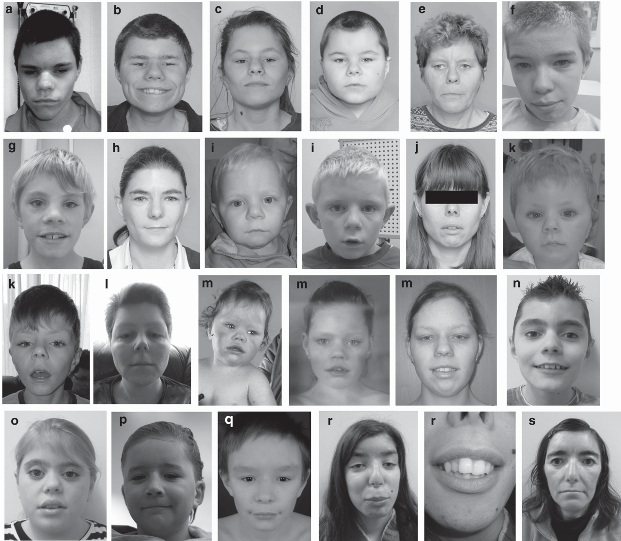
Figure 1 Clinical features of families 1–11 with ANKRD11 mutations. a =1A, b =1B, c =1C, d =1D, e =1E, f =2, g =3, h =4, i =5, j =6, k =7A, l =7B, m =7C, n =8, o =9, p =10, q =11, r =12A, s =12B. The facial shape seems to evolve from round to more triangular at a later age, as seen in patient 5 ( i ), 7A ( k ) and 7C ( m ). All patients have an upturned nose with a broad base to the nose and full nasal tip. Other characteristic features are broad or bushy eyebrows with synophrys, strikingly prominent eyelashes ( g , h , k , n , o ), a low posterior hairline, brachy/turriccephaly, a long philtrum, hypertelorism and prominent or protruding ears with dysplastic helices. Some patients have an exaggerated cupid's bow-shaped mouth ( a , i , k , m , n , o ) but other patients have a thin upper lip ( e , h , l , p , s ). The hair can be coarse ( a , b , d , l , q ).