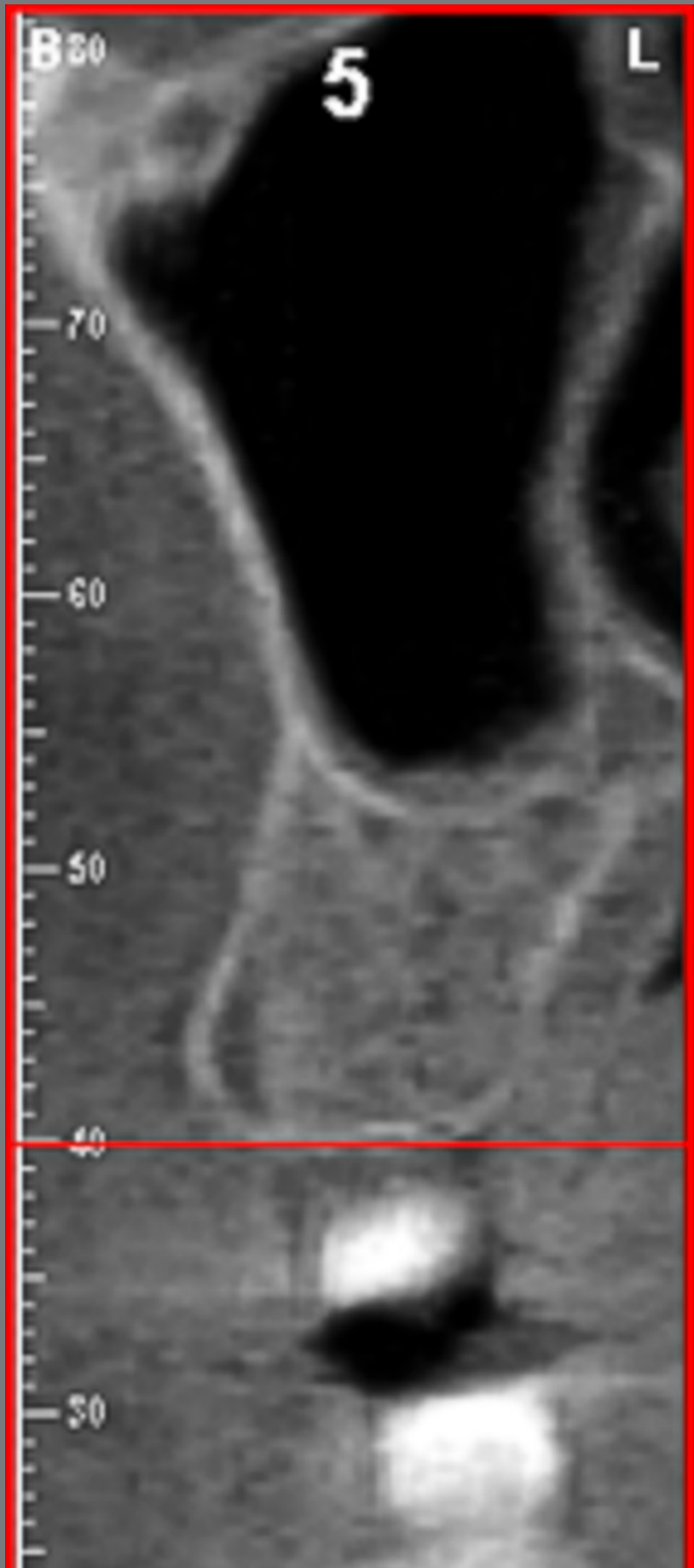
Figure 2: Measurement of vestibular and lingual cortical bone thickness at the determined heights (5mm from the bone crest).

of the maxilla on both sides); palatal maxilla (measurements made on the palatal bone cortex of the maxilla on both sides); Mandible (measurements made on the vestibular cortical of the mandible on both sides). To minimize possible biases in the survey, each subject was given a registration number, which was obtained by lot, to determine the sequence of the images to be analyzed. A trained and calibrated examiner performed measurements. Twenty-five individuals (20% of the sample) were initially evaluated and reassessed after three weeks to verify reproducibility. The Kappa index was used for categorical variables (ANB and VERT index), and the intraclass correlation coefficient (ICC), for quantitative variables (cortical bone thickness). Excellent reproducibility ( Kappa > 0.80 / ICC > 0.75 ) was found for all measures analyzed.