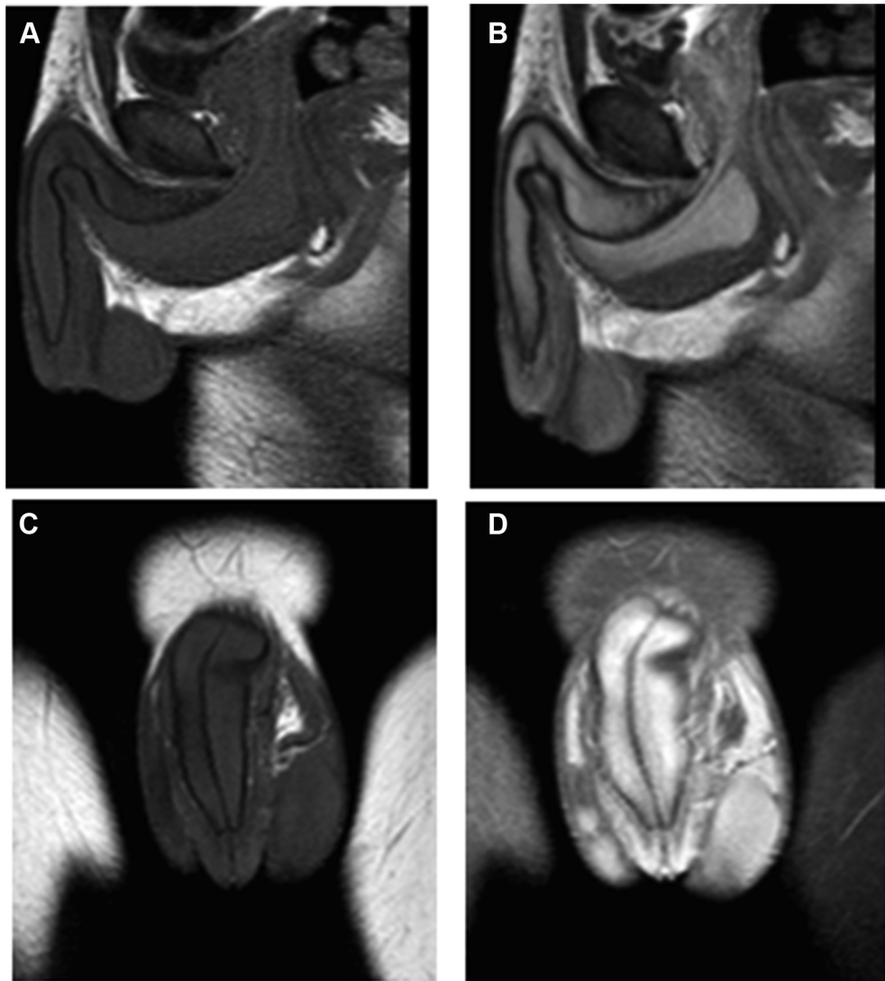
Figure 3. Patient 1: Magnetic resonance imaging (MRI) of the penis after treatment protocol. (A) Sagittal precontrast T1-weighted MRI. (B) Sagittal postcontrast T1-weighted MRI. (C) Coronal T1-weighted MRI after administration of gadolinium. (D) Coronal postcontrast T1-weighted MRI with fat saturation and after treatment showing normal appearance of the corpus cavernosum with complete resolution of the previously seen abscesses.

and drug administration, cefuroxime, or mostly secondary to the addition of the tadalafil.