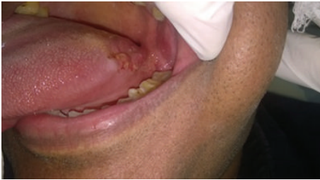
FIGURE 2: Ulcer with yellow crusted surface on the left posterolateral border of tongue.

showed ulcerated stratified squamous epithelium exhibiting suprabasal split (Figure 3). Many round acantholytic (Tzanck) cells with hyperchromatic nuclei were observed within the split (Figure 4). Basal cells were seen attached to the underlying connective tissue, below the split. A dense inflammatory cell infiltrate consisting mainly of plasma cells was seen in the connective tissue. These microscopic features were suggestive of PV. The direct IF showed deposits of IgG and C3 (complement) in a fish-net pattern along the spinous intercellular zone, which confirmed the diagnosis of PV.