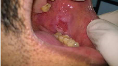
FIGURE 1: Ulcer on the left buccal mucosa, ovoid in shape.