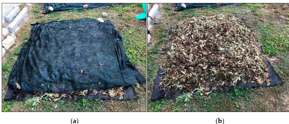
Figure 1. (a) Covered earthworm rearing; (b) Uncovered earthworm rearing with visible growth substrate.