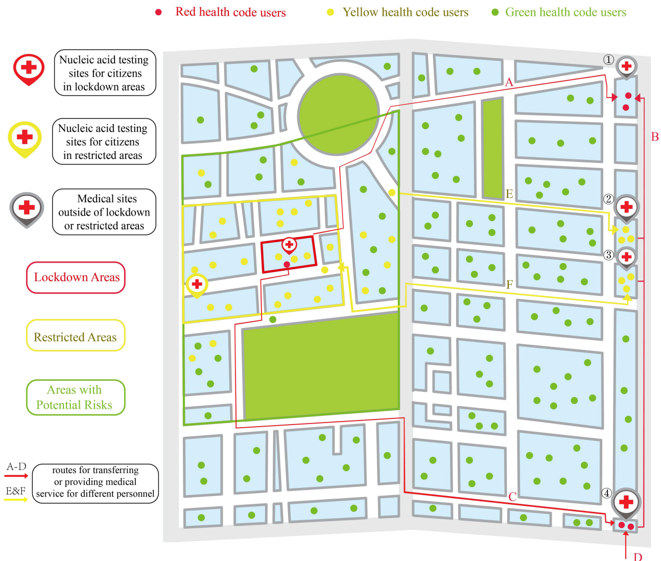
Figure 1 The schematic diagram of Chengdu's COVID-19 confinement arrangement (circle-layer policy) during the summer outbreak.

Notes: The medical sites and routes of personnel arrangement were listed as following: Medical sites 1: Infectious disease hospital for treating confirmed or suspected cases; Medical sites 2: Designated nucleic acid testing stations and hospitals for yellow health code users from areas with potential risks; Medical sites 3: Designated hospitals serving for patients from lockdown/restricted area; Medical sites 4: Centralized isolation sites for newly arrived red health code users with epidemiological history. Route A: Routes for transferring confirmed cases from lockdown or restricted areas to infectious disease hospital; Route B: Routes for transferring confirmed cases from centralized isolation sites, designated hospitals or testing sites to infectious disease hospital; Route C: Routes for transferring close contacts or secondary close contacts of confirmed cases from lockdown or restricted areas to infectious disease hospital; Route D: Routes for transferring red health code users with epidemiological history from airports/freeway toll station to centralized isolation sites; Route E: Routes for yellow health code users to get nucleic acid tests in designated sites or hospitals via private transportation; Route F: Routes for providing medical services to lockdown and restricted areas or transferring patients to hospitals when necessary.