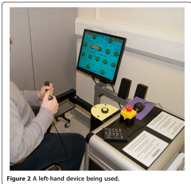
Figure 2 A left-hand device being used.

The computer program includes a base “software platform” for underlying functions and a set of activity-based tasks that was used to direct and control the exercises. The software also measures the number of hits in the assessment exercise. The assistance levels will adjust according to the performance in the assessment exercise. As the user performance increases, the assistance levels decrease by the set algorithm of the software. The computer screen provides visual and auditory feedback of the target location and the movement of the joystick. The baseline clinical examination and computer assessment exercise allows the initial exercise parameters (duration, nature of games, game levels and assistance level) to be set.