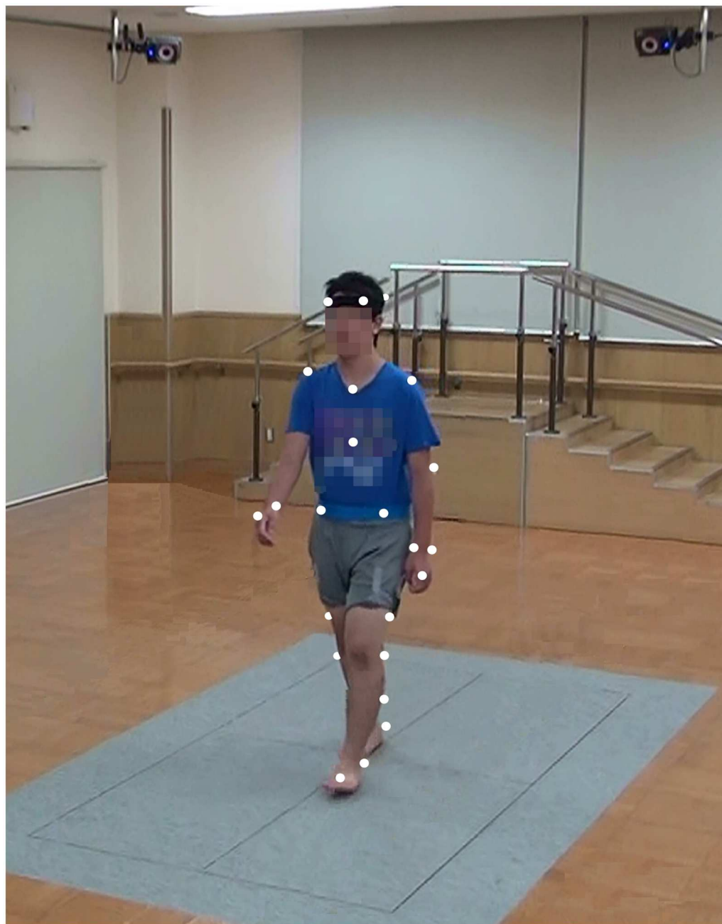
Fig 1. Three-dimensional motion analysis system. The system is comprised of 10 strobe cameras mounted from the ceiling and four force plates placed in the middle of the walkway. The white circles represent 14 mm reflective markers according to the Plug-in-Gait marker set.