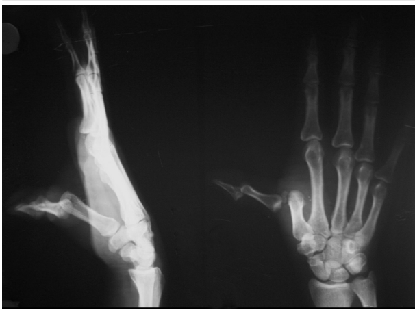
Figure 3. Showing Dislocation of MCP and IP Joints in Thumb

Our third case (in march 2011) of dislocation of MCP and IP joints of left thumb was present in twenty five year soccer player, who got injured during playing and visited to emergency department immediately. It was dorsal dislocation of both joints along with minor intraarticular fracture of base of distal phalanx (Figure 3). Reduction done in ring block anaesthesia, first IP joint reduced, then at MCP reduced. MCP joint got reduced by adducting to the metacarpal and hyperextending the joint, while proximal end of proximal phalanx is pushed against and over the metacarpal head with keeping flexion on IP joint to overcome action of flexor pollicis longus. Both joints splinted in 20-degree flexion for four week and then mobilized.