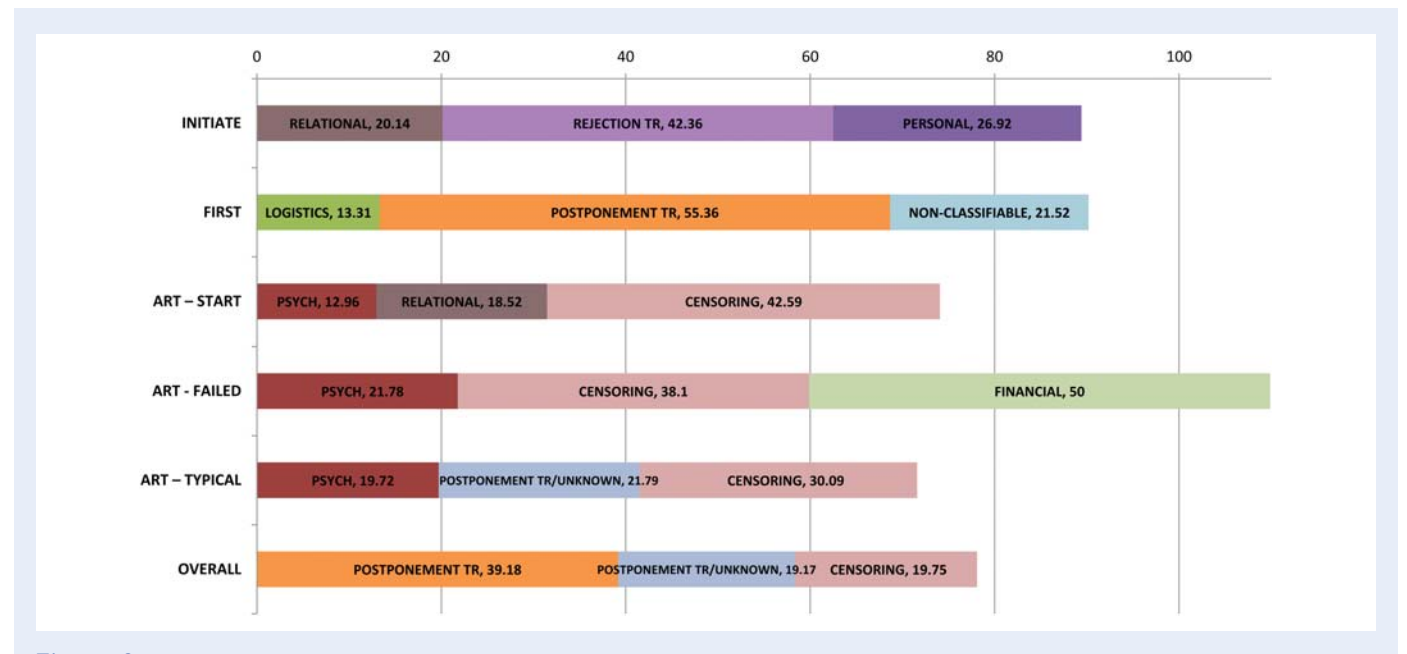
Figure 2 Percentage (%) of the three most selected categories of reasons for discontinuation overall and according to each treatment stage. INITIATE = during diagnosis, before initiation of treatment; FIRST = during first-order treatments like insemination or ovulation induction; ART-START = on the waiting list to start assisted reproductive techniques; ART-FAILED = after the first failed ART cycle; ART-TYPICAL = before completion of the typical ART regimen. Relational = relational problems; Rejection tr = rejection of treatment; Personal, personal reasons; Logistics = logistics/practical reasons; Postponement tr = postponement of treatment; Psych = psychological burden of treatment; Censoring = doctor censoring; Financial = financial issues; Postponement tr/unknown = postponement of treatment or unknown.