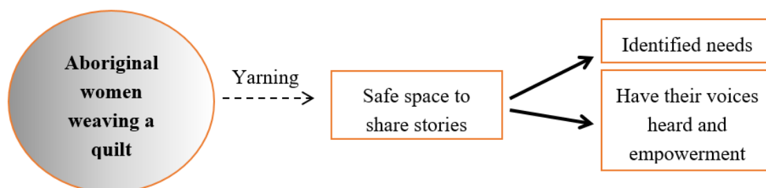
Figure 1. Process of data generation and observed outcomes.

Figure 1 illustrates the process and outcomes observed by the participants and research team.