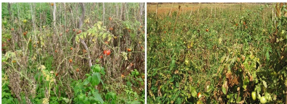
Fig. 1. Fusarium wilt caused by F. oxysporum f. sp. lycopersici in field conditions.

As a characteristic of soil-borne pathogen, FOL can survive extensively in soil as dormant propagules (chlamydospores). Host root presence triggers the germination of chlamydospores. The