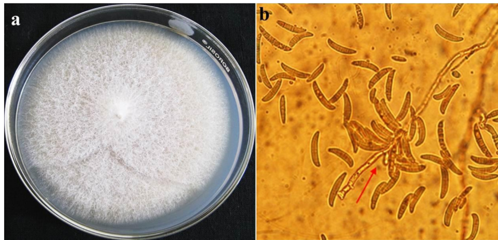
Fig. 2. (a and b). Cultural and morphological features of Fusarium oxysporum sp. lycopersici . (a). F. oxysporum colony of Fusarium sp. on PDA agar; (b). Microscopic view of macroconidia of F. oxysporum sp. lycopersici , macroconidia abundant, commonly three septate and the attachment of the macroconidia to the mycelium is observed.

infection hyphae adhere to and then penetrate the root surface. The mycelium invades the root cortical cells intercellularly and enters vascular system through the xylem pits. Subsequently, the fungus displays a unique pathway of infection where it tends to colonize exclusively inside the vessels of xylem, further rapidly colonize the host. Within the vessels, the fungus starts to produce microconidia, which are transported to upwards through sap stream upon detachment. Further, germination of microconidia leads to mycelial penetration of the upper vessels. The characteristic wilt symptoms appear due to vessel blockage triggered by the gathering of fungal hyphae and a combination of host-pathogen interaction such as, the release of toxins, gums, gels, and formation of tyloses. Typical disease indications, such as leaf epinasty, vein clearing, wilting and defoliation, appear and eventually precedes host plant death (Figs. 1 and 2). During this phase the vascular wilt fungus, which stays limited to the xylem vessels, propagates through parenchymatous tissue and begins to sporulate abundantly on surface of the plant such as, leaf, stem etc. Dissemination of the pathogen can occur via seeds, transplants, soil or other means (McGovern, 2015; Renu Joshi, 2018).