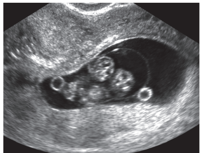
Fig. 1. Transvaginal ultrasound at 9 weeks of gestation demonstrates two yolk sacs in a MCMA pregnancy.

MCMA = monochorionic monoamniotic, MCDA = monochorionic diamniotic, MCTA = monochorionic triamniotic.