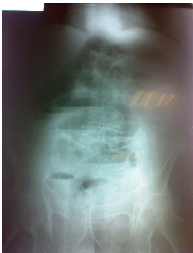
Figure 2 Small intestinal obstruction.