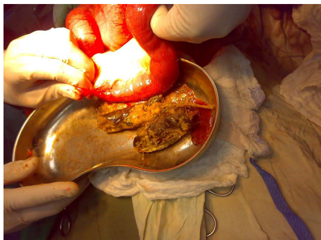
Figure 5 Eggplant in kidney dish.

are the most common, and are composed of vegetable matter (celery, pumpkin, grape skin, prune and persimmons) and contain a large amount of non-digestible fibres (cellulose, hemicellulose, lignin and fruit tannins). On the other hand, trichobezoars are gastric concretion of hair fibres which usually presents in patients with a history of psychiatric predisposition and in children with mental retardation. Meanwhile, pharmacobezoars consist of medication bezoars, such as cholestyramine, kayexalate resin, cavafeate and antacids, which adhere when in bulk. Lastly, lactobezoars are milk curd secondary to infant formula, described in low birth weight neonates fed on highly concentrated formula within their first week of life [6].