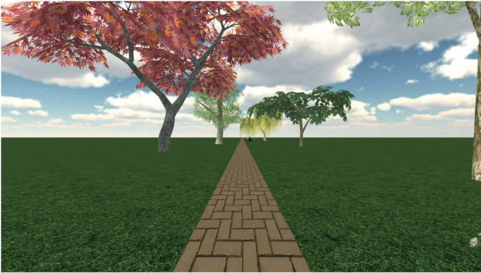
Figure 1. An Example of the Virtual Geographical Hill Slant Display Presented to Participants. Note. Please refer to the online version of the article to view the figures in colour.

due to the necessity for visually guided actions to accommodate to the environment, measures of explicit awareness tend to reflect perception of identification (Proffitt, 2009). However, haptic measurements, such as palm board adjustments, rely on heuristics that bypass the need to represent spatial layout (Fajen, 2007) and, therefore, tend to be a result of perception for action (Creem, & Proffitt, 1998; Proffitt, 2009). On completion of slant estimation in the first optic flow condition, participants repeated the procedure with the other optic flow condition.