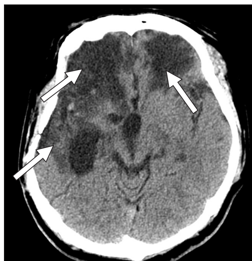
Fig. 2. A cranial computerized tomography scan from case 2, showing extensive encephalomalacia at the bilateral frontal lobes and the right temporal lobe from previous trauma (arrows).

A 36-year-old male, who had no significant medical history nor neurologic abnormalities, was involved in a motorcycle accident. He was admitted to the emergency room unconscious, and after being diagnosed with bilateral frontal and right temporal intracranial hemorrhage (Fig. 2), he underwent craniectomy and hematoma evacuation. Two years after the onset of the injury, he was transferred to the department of rehabilitation for intensive therapy. The K-MMSE score at the time was 15. A manual muscle power test showed that the MRCs of both the upper and lower extremities of the right side were grade IV, and those of the upper and lower extremities of the left side were grade II and I, respectively. He had suffered from teeth grinding and jaw clenching for 2