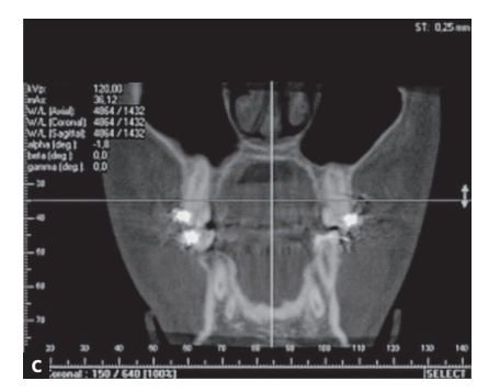
Figure 1 - Bispinal reference line, to standardize the sagittal and axial sections (A and B). Reference line between the buccal bone crests of maxillary first molars (C).