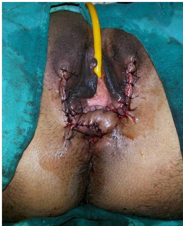
Fig. 3: Flaps transposed at defect in side-to-side manner