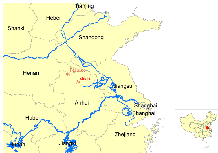
Figure 1 Location of the two study sites. One study site was located in the Zhao village, Zhuji township, Huaiyuan county (33°14'N and 116°51'E), Anhui province (site A), the other one was located in Pengguanyao village, Peiqiao township, Yongcheng county (33°48'N and 116°12'E), Henan province.

China launched the National Malaria Elimination Program (NMEP) in 2010, with its goal to eliminate malaria in China by 2020 [21,22]. In the NMEP, vector control is one of the important components in rapid response to the malaria transmission in outbreak foci as well as to improve the efficiency of case management, which has been promoted by both World Health Organization (WHO) and Roll Back Malaria Partnership (RBM) for reduction of malaria transmission [23,24]. One of the most difficult issues in the elimination process is to have real-time surveillance and response systems to monitor the changes of transmission patterns in order to guide the elimination efforts in the high risk areas [8]. It is believed that transmission intensity of human malaria is highly dependent on the vector capacity and competence of local mosquitoes. Recent research aimed at understanding the relationship between vector capacity and the transmission patterns of malaria is of significant concern [25,26]. Therefore, it is important to understand the changes of