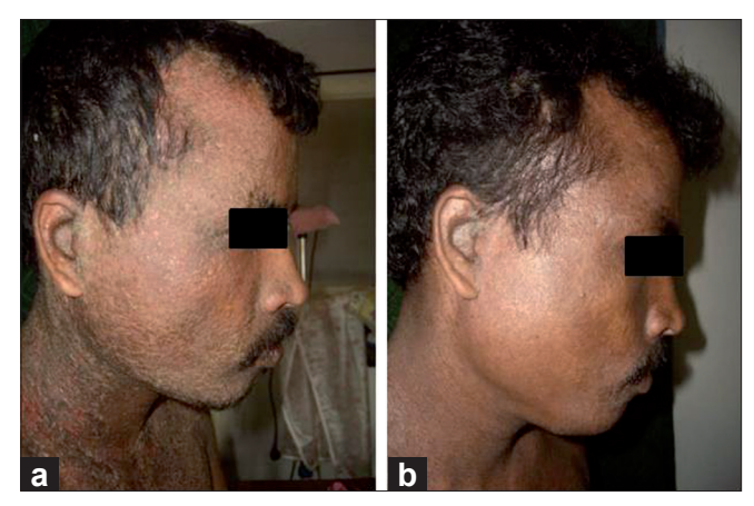
Figure 1: (a) Scaly papules on the face before treatment, (b) After treatment

Examination revealed multiple dirty hyperpigmented papules that at places had coalesced to form plaques distributed symmetrically over the scalp, trunk, abdomen, back, groins, and scrotum. There were thick hyperpigmented greasy scales seen in both the external auditory canal [Figure 1a]. The lesions in the axillae had a verrucous appearance with a foul smell [Figure 2a]. Greasy scaling was seen over the involved sites and there was painful fissuring. A few vesicles with clear fluid were seen over the abdomen and the scapular area. The dorsal aspect of both hands had multiple tiny discrete skincolored papules resembling acrokeratosis verruciformis of