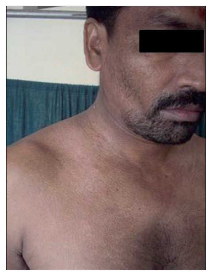
Figure 4: Brother after treatment

The patient was started on low-dose isotretinoin (20 mg/day) along with a tapering dose of oral corticosteroids and topical bland emollients. There was dramatic response within 2 weeks, with >50% improvement in the condition of our patient [Figure 1b, 2b]. We had started the patient's elder brother [Figure 4] on high-dose isotretinoin (40 mg/day) at the time of presentation and once his lesions were under control this was reduced to low-dose isotretinoin.